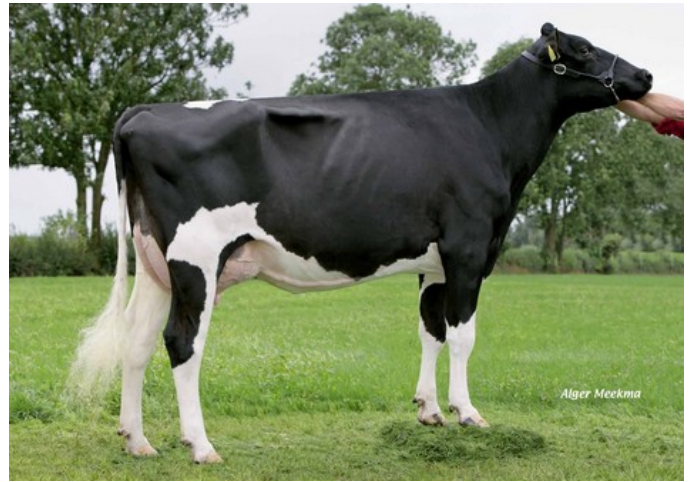
Bacchus Eliza Mae VG-89

VG-86 Picanto x GP-84 Bookem x VG-89 Alexander x VG-85 Bolton x VG-87 O Man x EX-90 Mtoto x EX-90 Rudolph x EX-95 Leadman x VG-89 Blackstar x VG-87 Jason