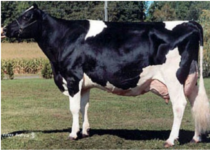
Whittier-Farms Lead Mae EX-95