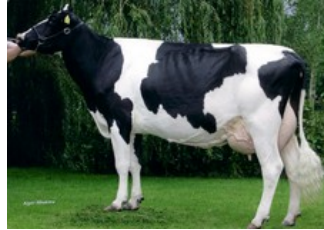
De Biesheuvel Delta Javina VG-88