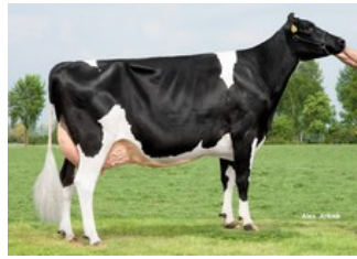
De Biesheuvel Javina 19 VG-88