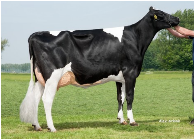
Willem's Hoeve Javina 903 TY VG-87