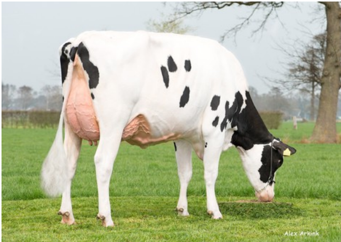
Holbra Sancodi VG-88