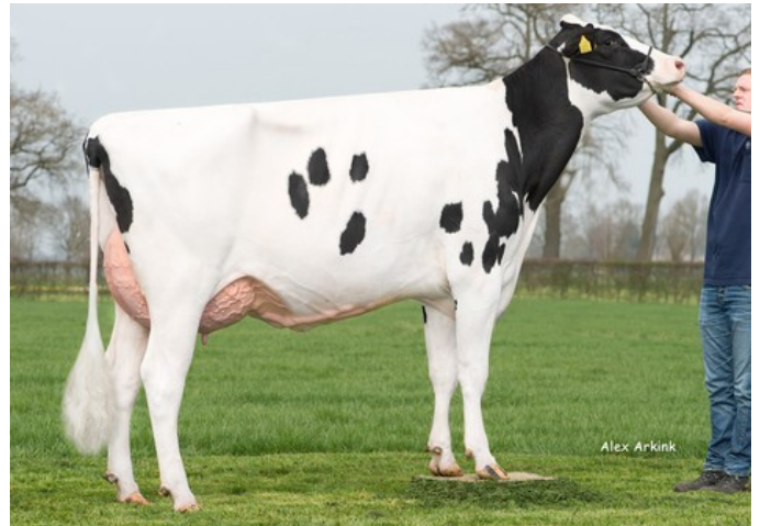
Holbra Sancodi VG-88

VG-88 Commander x VG-87 Meridian x VG-89 Snowman x VG-85 Bolton x VG-87 O Man x EX-90 Morty x VG-88 Durham x EX-90 Rudolph x EX-95 Chief Mark x EX-91 Sexation