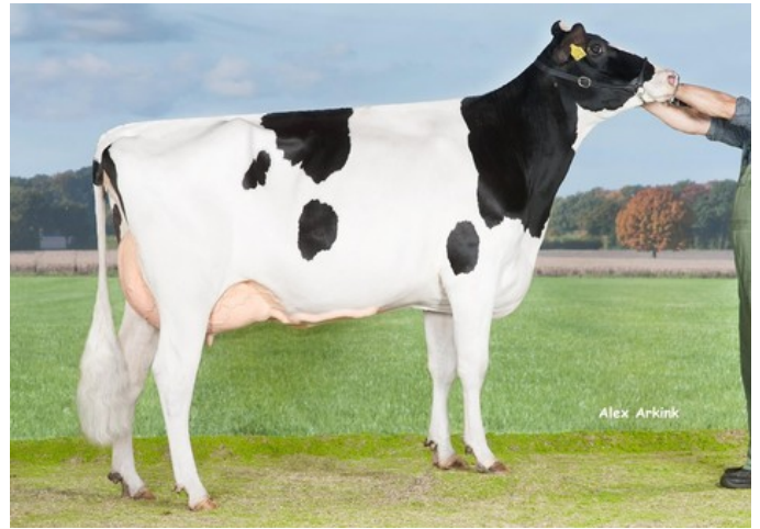
Holbra Sandian VG-88

VG-86 Kingboy x VG-88 Meridian x VG-89 Snowman x VG-85 Bolton x VG-87 O Man x EX-90 Morty x VG-88 Durham x EX-90 Rudolph x EX-95 Chief Mark x EX-91 Sexation