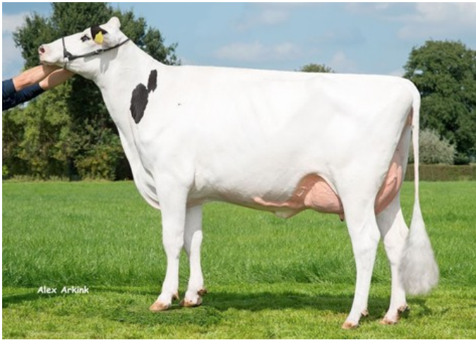
Holbra Sandoya VG-86