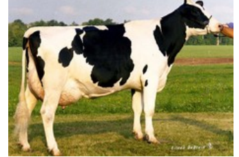
Tui Onyx Nick VG-86

Commander x VG-88 Ladd P x VG-85 Lawn Boy P-Red x G-79 Sharky x VG-86 BW Marshall x VG-85 Lord Lily x VG-86 United Nick x VG-89 Ned Boy x VG-86 Bell