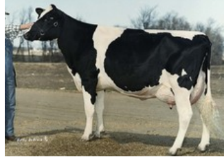
Etazon LL Neon VG-85