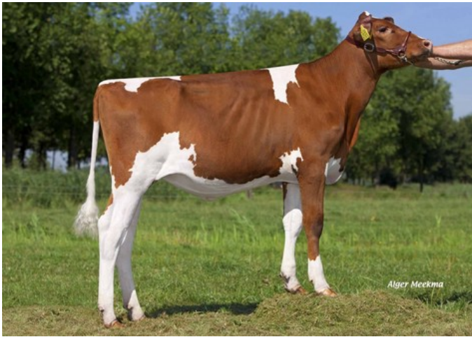
VanHolland Shakira 3 PP-Red VG-88