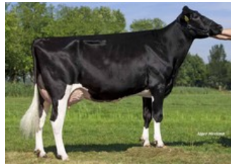
VanHolland Shakira 1 P RDC VG-85