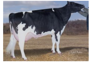
Windy-Knoll-View Policy EX-93