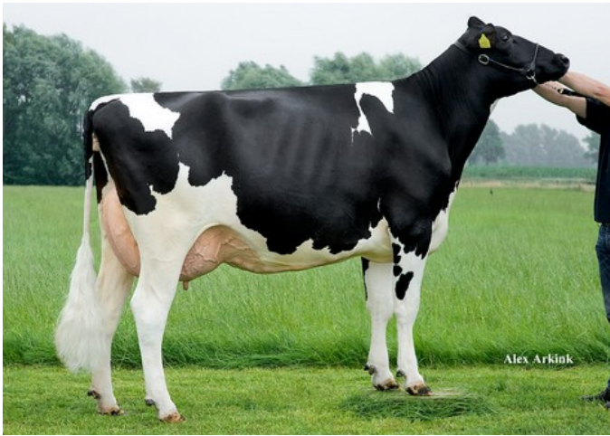
Holbra Ferdi VG-87