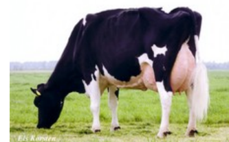
Green-Valley Anita VG-89

VG-87 Spencer x VG-86 Canvas x VG-89 Jesther x VG-85 Cash x VG-87 Captain x VG-87 Cleitus x GP-83 Big Al x VG-88 Nugget x EX-94 Arlinda Chief x EX-90 Kingpin Dam to Lostau P, the #1 Proven Polled R&W Bull on RZG (08-2017)!