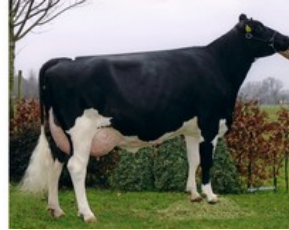
Green-Valley Almere RDC VG-86