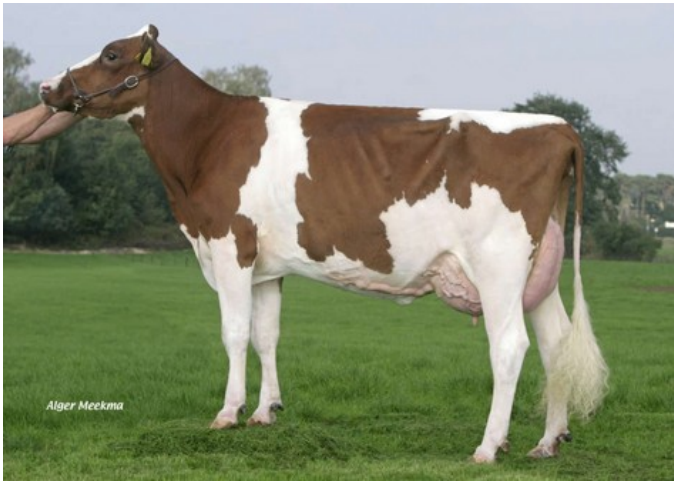
Green-Valley Allure-Red VG-87