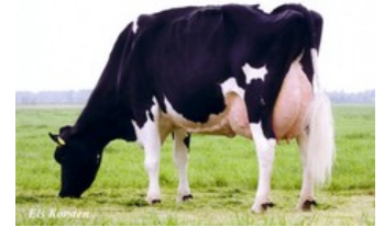
Green-Valley Anita VG-89

VG-87 Spencer x VG-86 Canvas x VG-89 Jesther x VG-85 Cash x VG-87 Captain x VG-87 Cleitus x GP-83 Big Al x VG-88 Nugget x EX-94 Arlinda Chief x EX-90 Kingpin Dam to Lostau P, the #1 Proven Polled R&W Bull on RZG (08-2017)!