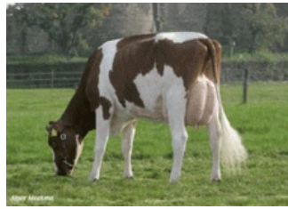
Green-Valley Allure-Red VG-87