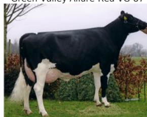
Green-Valley Almere RDC VG-86