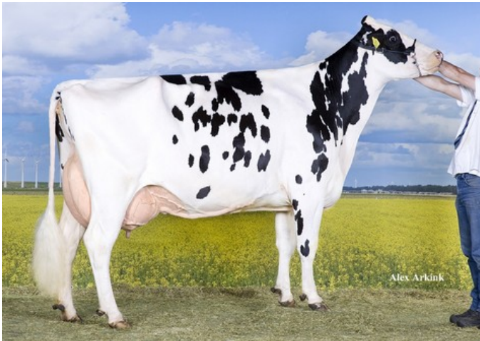
Giessen Cinderella 15 EX-91