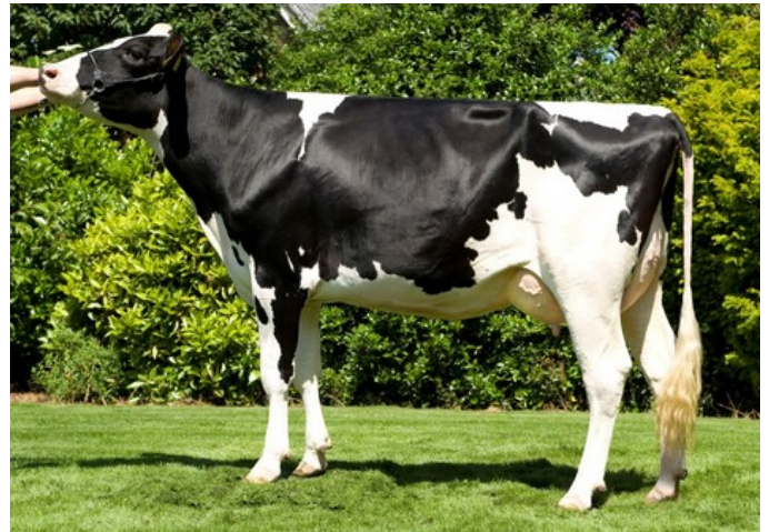
Giessen Cinderella 22 VG-85

VG-89 Balisto x VG-86 Hunter x VG-85 Bolton x EX-91 Shottle x VG-89 Durham x EX-92 Encore x VG-88 Mark Cinder x EX-96 Tony x EX-94 Triple Threat x EX-90 Elevation