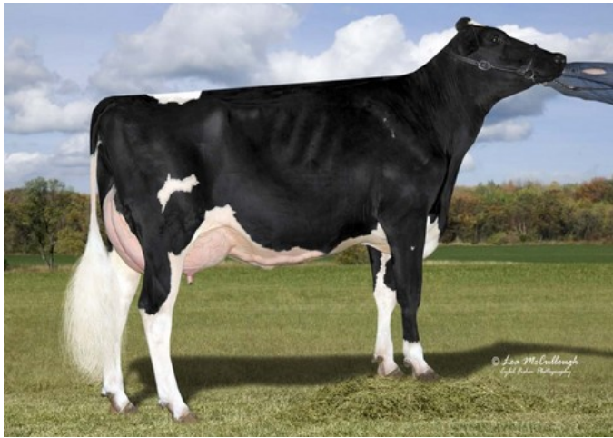
Cookiecutter MOM Halo VG-88