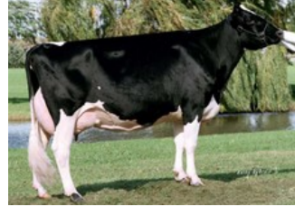
Snow-N Denises Dellia EX-95