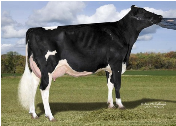
Cookiecutter MOM Halo VG-88