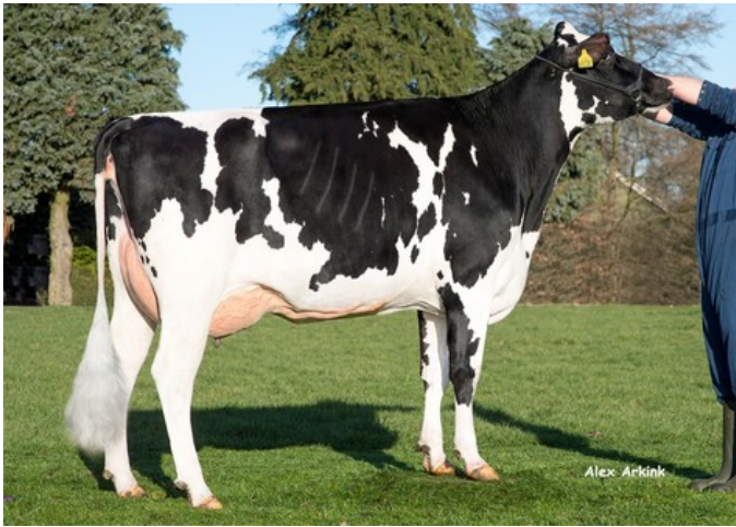
K&L PL Dellia 6538 VG-87