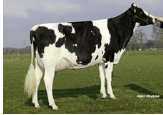
Southland Dellia 44 EX-90