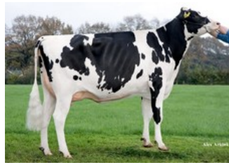
Manders Dellia 8 GP-84