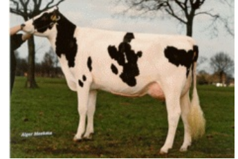
Southland Dellia 2 VG-88

VG-87 Platinum x GP-84 G-Force x VG-87 Goldwyn x GP-84 Shottle x EX-90 Adam x VG-88 Lucky Leo x VG-86 Largo x VG-88 Jabot x VG-87 Southwind x VG-85 Chairman