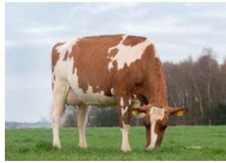
Drouner Aiko 1539 Red VG-88