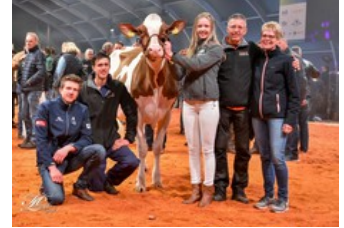
familie Albring EK met Aiko 1445 VG-

EX-91 Olympian RC x VG-87 Freddie x EX-91 Goldwyn x EX-95 Durham x EX-93 Prelude x EX-94 Jubilant RF x EX-96 Marquis King x EX-90 Brutus x EX-90 Lucifer Lad