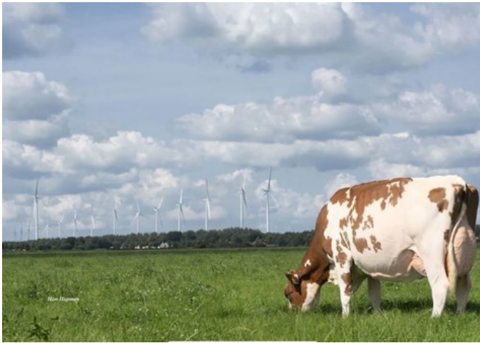
Drouner AJDH Aiko 1288 EX-91