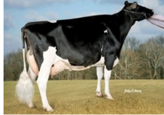
Kamps-Hollow Durham Altitude EX-95