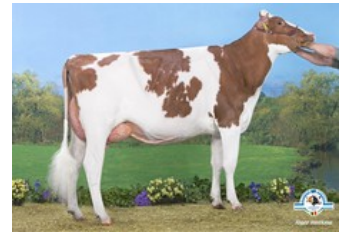
Drouner DH Aiko 1445 VG-89