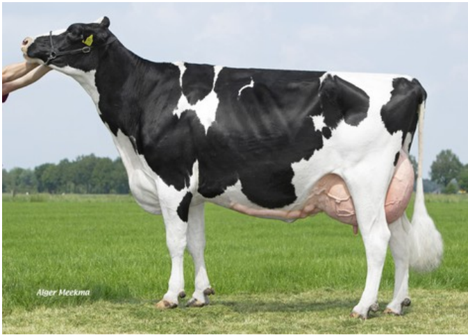
Holbra Malon 3 VG-88