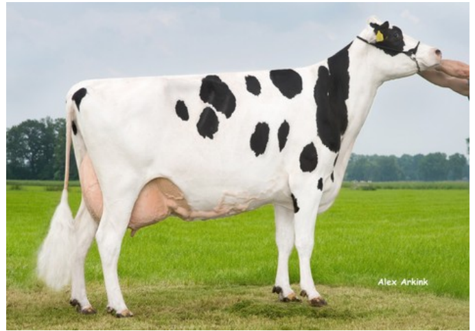
Holbra Malon VG-87

VG-88 Balisto x VG-87 Man-O-Man x VG-87 Mascol x VG-88 Durham x EX-90 Rudolph x EX-95 Chief Mark x EX-91 Sexation x EX-93 Elevation x EX-94 Highmark x EX-91 Bootmaker Lee