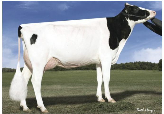
Des-Y-Gen Planet Silk EX-90

Rimbot x Rainow x Rubels-Red x GP-84 Salvatore Rc x Rubicon x GP-83 Cashcoin x VG-87 Snowman x EX-90 Planet x VG-85 Bolton x VG-87 Goldwyn