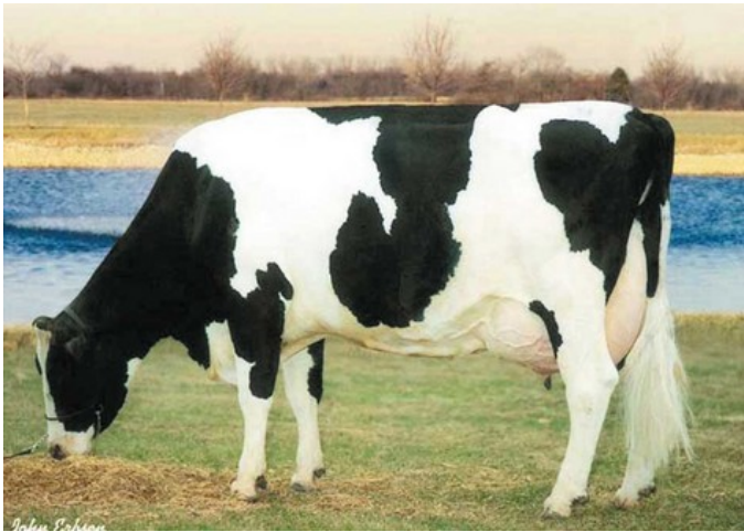
Regancrest Tesk Della EX-90