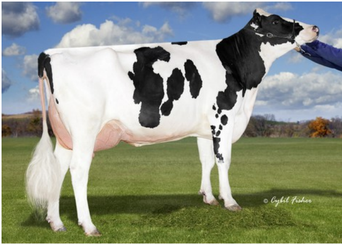
Bacon-Hill Salvatore Kay RDC GP-82