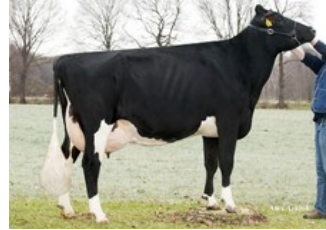
Apina Massia 102 RDC EX-90