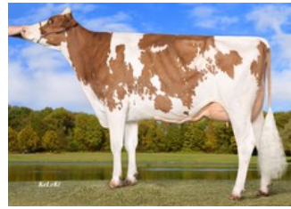
Wilder Smile Red VG-85