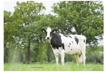
Sanderij Massia Sneeuw witje RDC