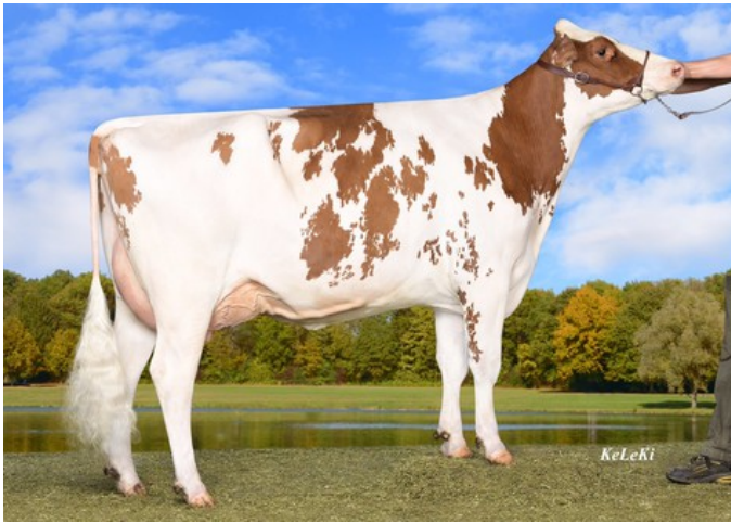
Wilder Saturn P Red VG-88