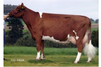
Apina Massia 21 EX-90

Borax-Red x Taskforce P-Red x Eloy RDC x GP-84 Yoda x VG-85 Mission P RDC x VG-88 Apoll P Red x VG-85 Brekem RDC x VG-89 Snowman x EX-90 Shottle x EX-90 Lentini