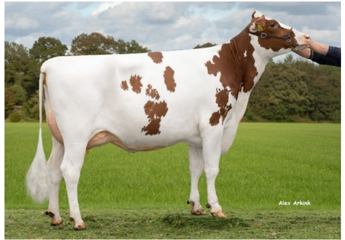
De Oosterhof 3STAR Juliane Red

Enclave x Star P RDC x GP-84 Rubels-Red x VG-85 Salvatore Rc x VG-89 Rubicon x VG-87 Supersire x VG-85 Alexander x EX-91 Goldwyn x EX-95 Durham x EX-93 Prelude