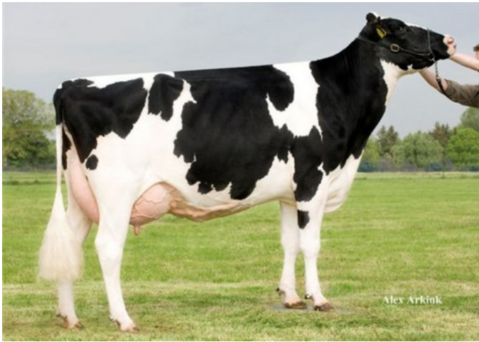
Holbra Pam VG-87