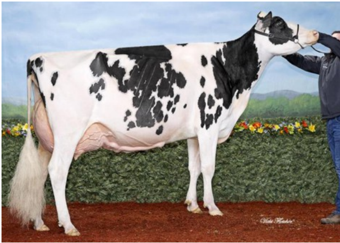
Idee Windbrook Lynzi EX-95