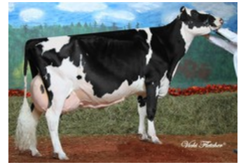
Idee Louis Luise EX-94