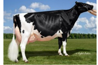
Idee Goldwyn Lynley EX-94; Goldwyn

Perennial x Delta-Lambda x Solomon x VG-85 Atwood x EX-95 Windbrook x EX-92 Goldwyn x EX-94 Louie x VG-87 Bellwood x EX-92 Astro Jet x VG-85 Lynmack