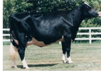
Ravenswell Lydia EX-92