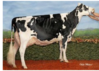
Idee Goldwyn Lucia EX-92