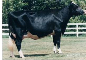
Ravenswell Lydia EX-92