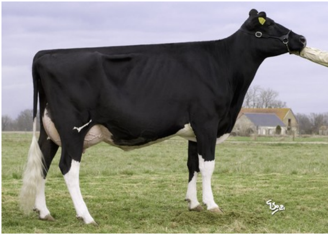
Saxony Durham Alicia EX-90