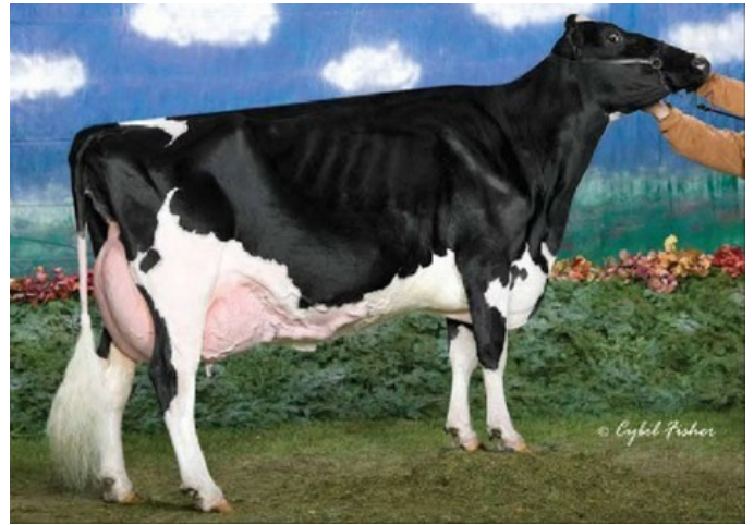
Amlaird Lee Alice EX-94

Rolo x Poncho x VG-86 Rubi-Haze x Kingboy x Mogul x GP-84 Shotgun x EX-90 Durham x EX-94 Lee x EX-94 Skychief x EX-94 Starbuck