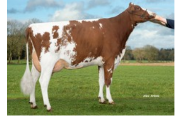
3STAR OH Sunnyside Red

Redford x Sorelio P x Rubels-Red x GP-84 Salvatore Rc x Rubicon x GP-83 Cashcoin x VG-87 Snowman x EX-90 Planet x VG-85 Bolton x VG-87 Goldwyn