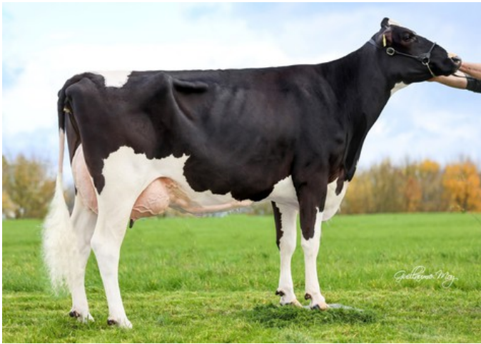
SHS England VG-87