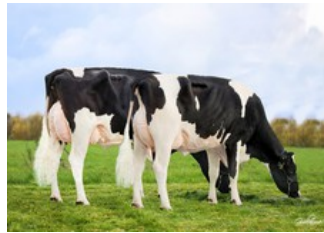
SHS Emma P and SHS England VG-87