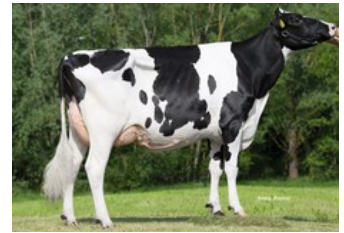
Broekhuis RUW Elite VG-86