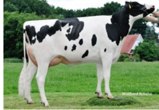
WEU Willow GP-83