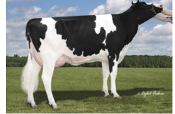
Welcome Man-O-Man Walton VG-85

Vivify x Migel x GP-83 Vh Crown x VG-87 Cameron x VG-86 Barclay x Molotov x GP-83 Shamrock x VG-85 Man-O-Man x VG-88 Colby x VG-87 Augustine