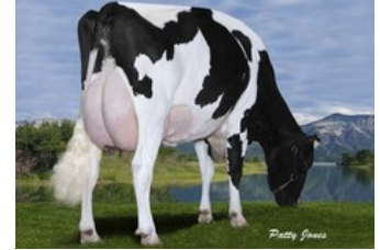
Gen-I-Beq Goldwyn Secret RC VG-87

Romaner RDC x VG-87 Augustus P Red x VG-85 AltaDateline x GP-84 Salvatore Rc x Rubicon x GP-83 Cashcoin x VG-87 Snowman x EX-90 Planet x VG-85 Bolton x VG-87 Goldwyn