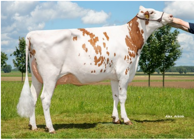
3STAR OH Janna Red VG-87