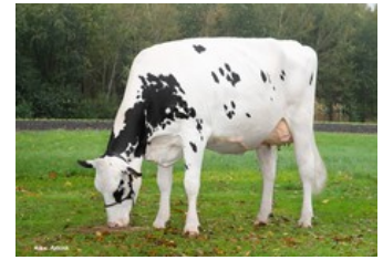
Diekers K&L DL Whiskey RDC VG-85