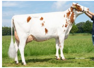
K&L SV Sunny Red GP-84