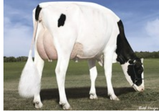
Des-Y-Gen Planet Silk EX-90