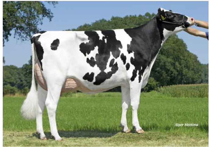
Schreur Serena 13 PP RDC VG-87

Borax-Red x Sailor PP x VG-87 Apo Red PP x VG-85 Silver x GP-83 Earnhardt P x GP-82 Colt P x VG-85 Socrates x VG-87 Goldwyn x VG-87 Durham x VG-86 Formation