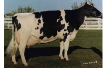
Golden-Oaks Mark Prudence EX-95

Mask Red x Freestyle-Red x GP-83 Andy-Red x GP-82 Apprentice RDC x VG-89 Rubicon x GP-83 Aikman RDC x VG-85 Man-O-Man x VG-87 Mascol x VG-88 Durham x EX-90 Rudolph