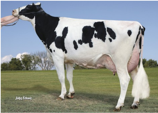
Plain-Knoll Lylas 1359-ET VG-85