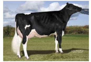
Cookiecutter MOM Halo VG-88