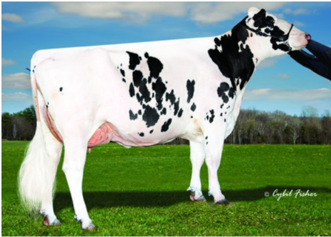
Cookiecutter Mn Hazelle EX-92