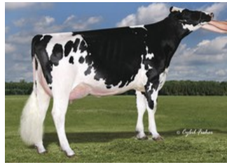
Cookiecutter Epic Hazel-ET EX-92