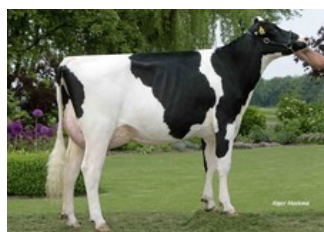
Barnkamper Marilyn 252 EX-90