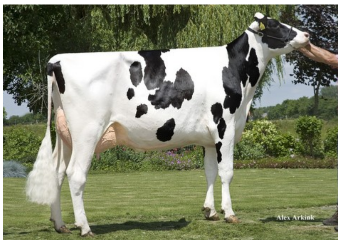
Barnkamper Marilyn 381 VG-88