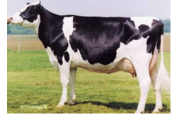
Dixie-Lee Aspen EX-92

Enclave x Sinan PP x VG-86 Solitair P Red x VG-85 Abi Red PP x VG-87 Powerball-P x VG-86 Snow RF x VG-85 Observer x VG-88 Shottle x VG-87 O Man x VG-86 BW Marshall