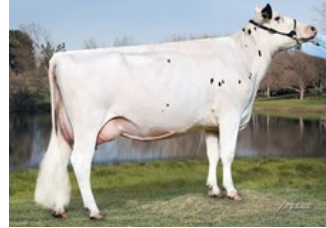
Teemar Shottle Aloha VG-88