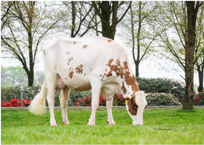
Amber PP Red VG-86