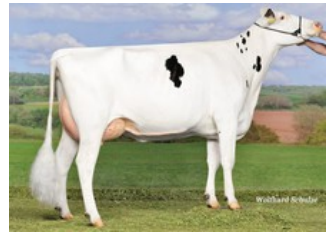
Aida RDC VG-86