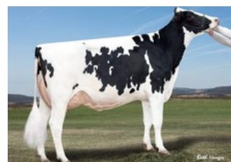
Gold-N-Oaks Arabell 1765 VG-88,