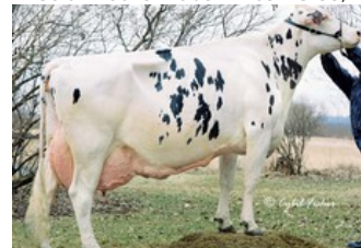
Gold-N-Oaks Duster Cindy VG-88

Tricky Red x Freestyle-Red x GP-84 Riveting x EX-91 Superhero x Silver x GP-82 Supersire x VG-87 Bookem x VG-88 Man-O-Man x VG-89 Shottle x EX-94 Morty