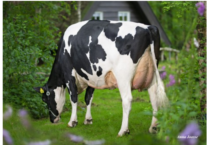
De Oosterhof Dg Rose RDC VG-89

Redlea RDC x VG-86 Gameday x GP-84 AltaAltuve RDC x VG-86 Salvatore Rc x VG-89 Rubicon x GP-83 Aikman RDC x VG-85 Man-O-Man x VG-87 Mascol x VG-88 Durham x EX-90 Rudolph