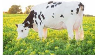
Dymentholm Sunview Sunday VG-87