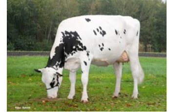
Diekers K&L DL Whiskey RDC VG-85

Skat P RDC x VG-87 Augustus P Red x VG-85 AltaDateline x GP-84 Salvatore Rc x Rubicon x GP-83 Cashcoin x VG-87 Snowman x EX-90 Planet x VG-85 Bolton x VG-87 Goldwyn