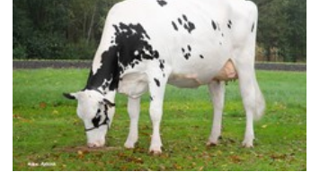
Diekers K&L DL Whiskey RDC VG-85

Skat P RDC x VG-87 Augustus P Red x VG-85 AltaDateline x GP-84 Salvatore Rc x Rubicon x GP-83 Cashcoin x VG-87 Snowman x EX-90 Planet x VG-85 Bolton x VG-87 Goldwyn