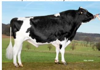
Same family: Koepon Beatclub