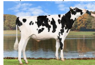
Same family: Koepon Showking

Skat P RDC x Ranger-Red x GP-83 AltaTop-Red x GP-83 Salvatore Rc x VG-86 Silver x VG-87 Man-O-Man x VG-85 Jeeves x VG-85 Shottle x VG-86 Simon x VG-86 Merrill