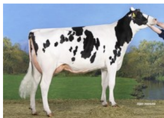
Koepon Mano Classy 93 VG-87