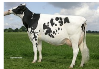
Koepon Shottle Classy 16 VG-85