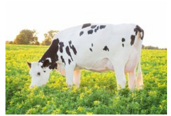
Dymentholm Sunview Sunday VG-87