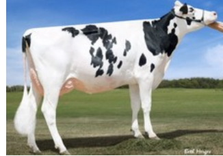
Dymentholm Sunview Sunday VG-87