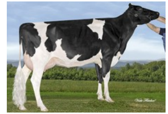
Gen-I-Beq Bolton Silence VG-85