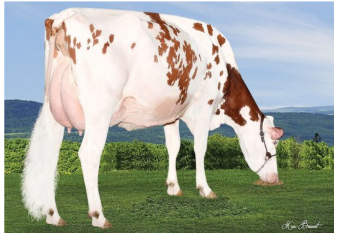
Lesperron Aikman Sofia-Red VG-87 EX-90

Forward x GP-83 Crialis RF x Rubels-Red x GP-84 Salvatore Rc x Rubicon x GP-83 Cashcoin x VG-87 Snowman x EX-90 Planet x VG-85 Bolton x VG-87 Goldwyn