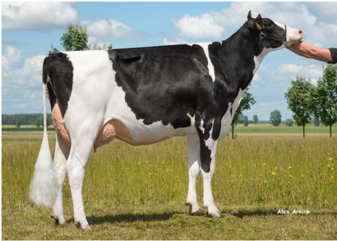
3STAR OH Shirly RDC GP-83