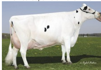
Gold-N-Oaks Morty Malibu EX-94