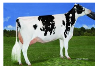
Ms Gold-N-Oaks Maybaline VG-88