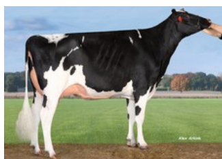
Pen-Col Superhero Mistral EX-91