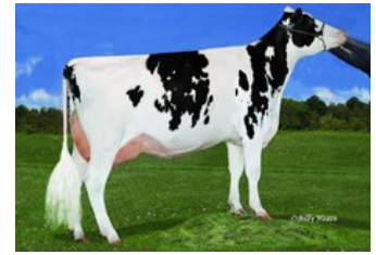
Ms Gold-N-Oaks Maybaline VG-88