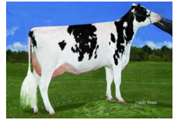
Ms Gold-N-Oaks Maybaline VG-88