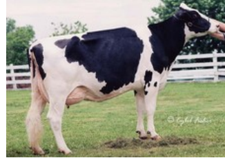
Mayerlane-DK Hiawatha EX-90