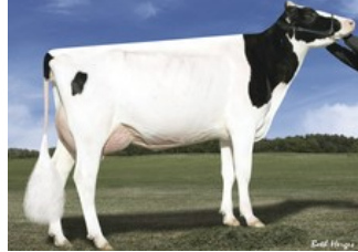
Des-Y-Gen Planet Silk EX-90