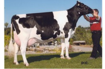
Gen-I-Beq Durham Sherry VG-87

Member PP Red x VG-87 Freestyle-Red x VG-85 AltaDateline x GP-84 Salvatore Rc x Rubicon x GP-83 Cashcoin x VG-87 Snowman x EX-90 Planet x VG-85 Bolton x VG-87 Goldwyn