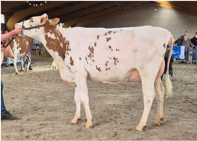
Diekers 3STAR OH Florijn VG-87