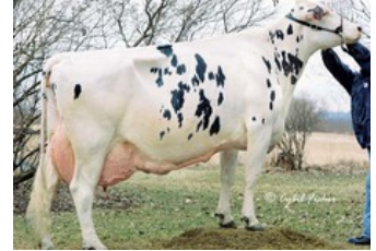
Gold-N-Oaks Duster Cindy VG-88

Tricky Red x VG-86 Ranger-Red x GP-84 Riveting x EX-91 Superhero x Silver x GP-82 Supersire x VG-87 Bookem x VG-88 Man-O-Man x VG-89 Shottle x EX-94 Morty