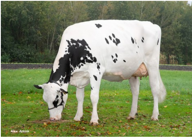
Diekers K&L DL Whiskey RDC VG-85