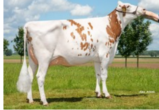
3STAR OH Janna Red VG-87