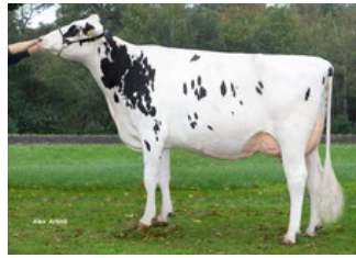
Diekers K&L DL Whiskey RDC VG-85