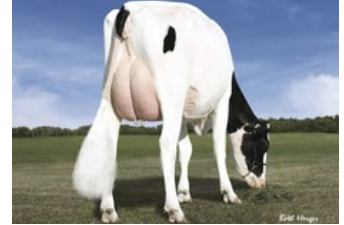
Des-Y-Gen Planet Silk EX-90

Sega P RDC x VG-87 Augustus P Red x VG-85 AltaDateline x GP-84 Salvatore Rc x Rubicon x GP-83 Cashcoin x VG-87 Snowman x EX-90 Planet x VG-85 Bolton x VG-87 Goldwyn