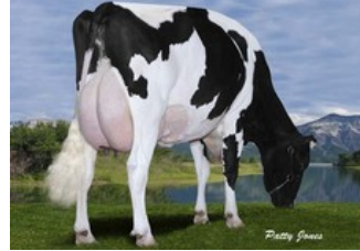
Gen-I-Beq Goldwyn Secret RC VG-87