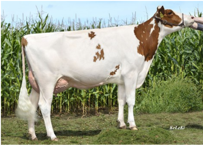
WEU Dream Red VG-87