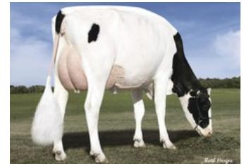
Des-Y-Gen Planet Silk EX-90