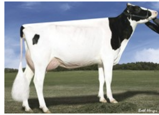
Des-Y-Gen Planet Silk EX-90