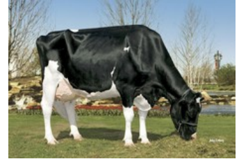
Kamps-Hollow Durham Altitude EX-95

Rammstein Red x Freestyle-Red x VG-85 Swingman Red x Alaska Red x VG-85 Salsa RC x VG-87 Supersire x VG-85 Alexander x EX-91 Goldwyn x EX-95 Durham x EX-93 Prelude