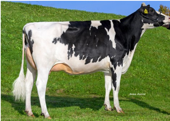
3STAR OH Maiball GP-84