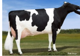
Sandy-Valley Bolt Sheila EX-92