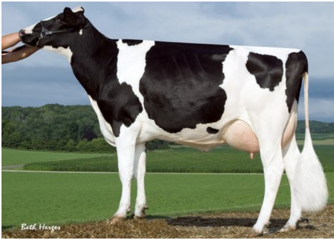
Sandy-Valley Plane Sapphire VG-87