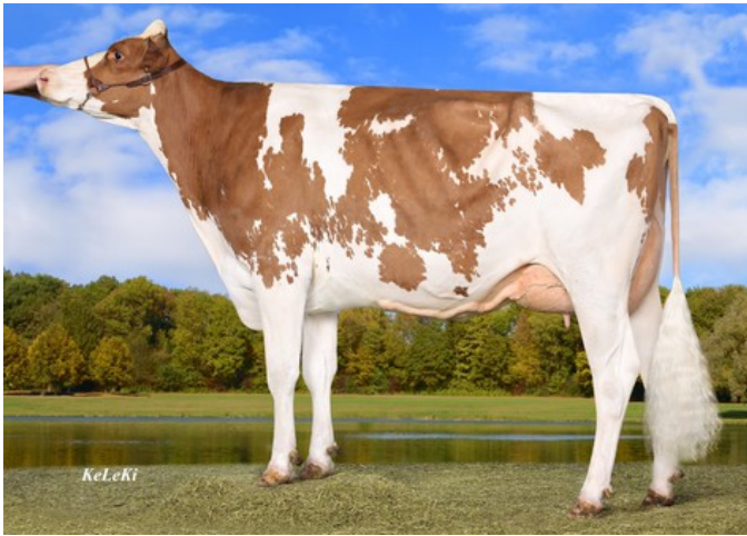
Wilder Smile Red VG-85