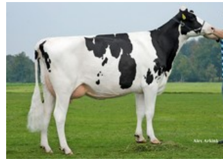
Sanderij Massia Sneeuw witje RDC