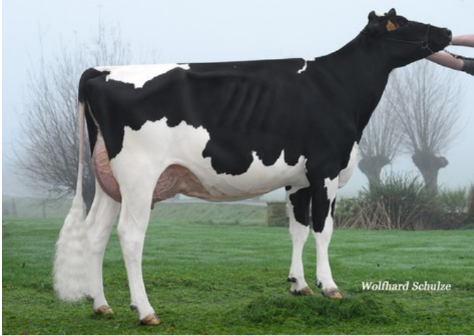
Lis K&L Xemmi 7970 VG-88